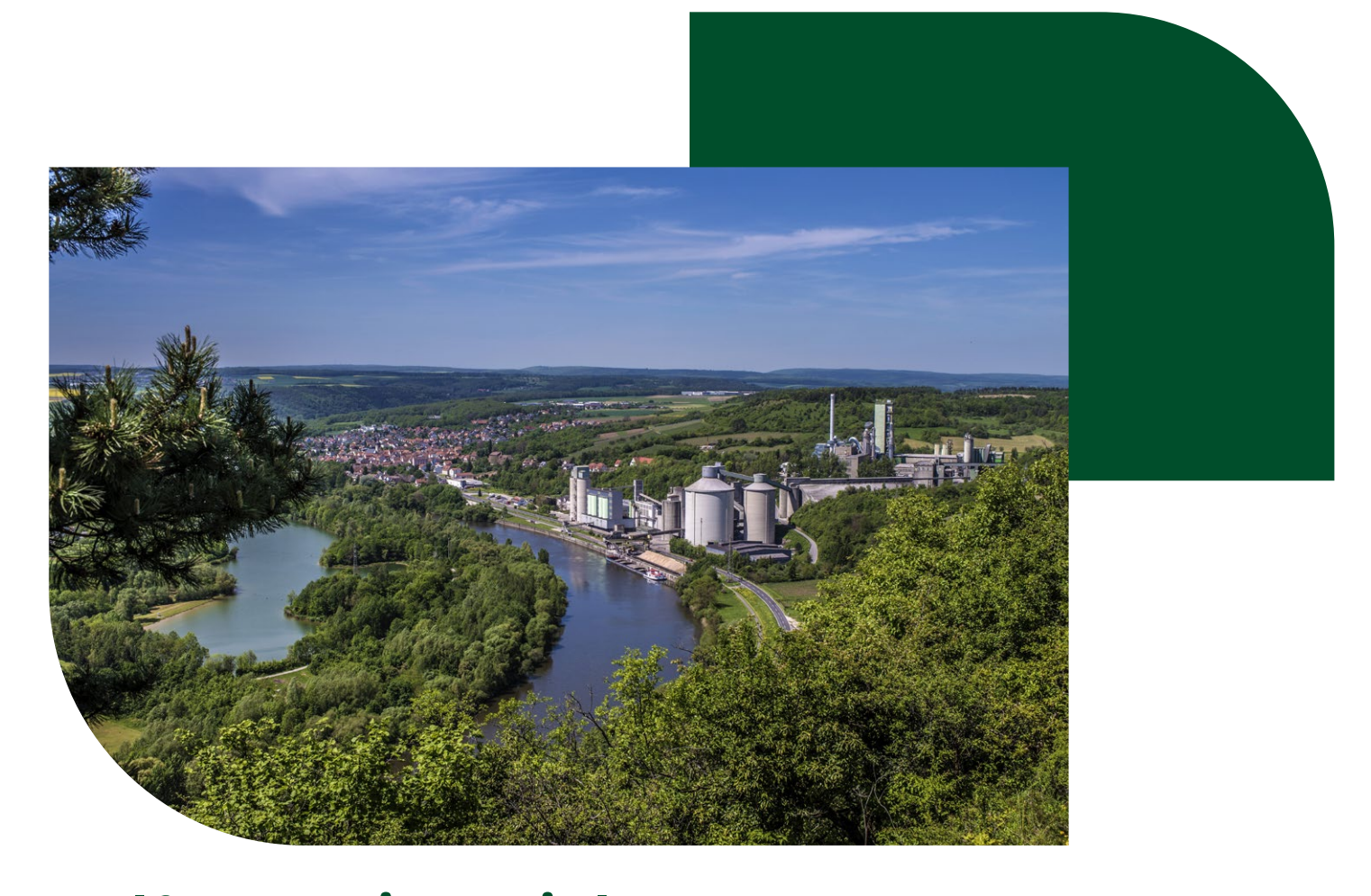
Half-Year Financial Report January to June 2023